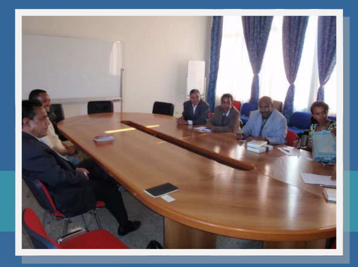
Photo: A senior EUCLID official assessing educational satisfaction during an official visit at a EUCLID Participating State Ministry of Foreign Affairs.