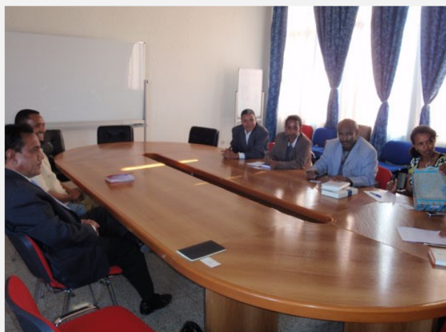
Photo: A senior EUCLID official assessing educational satisfaction during an official visit at a EUCLID Participating State Ministry of Foreign Affairs.