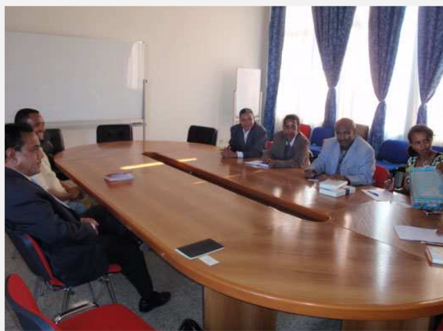
Photo: A senior EUCLID official assessing educational satisfaction during an official visit at a EUCLID Participating State Ministry of Foreign Affairs.