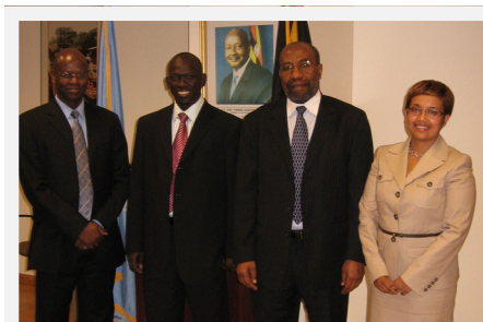
Above: EUCLID visit to the Permanent Mission of Uganda to the United Nations, September 2009.

cle 6ter of the Paris Convention which grants intellectual property protection to international intergovernmental organizations (see: http://www.wipo.int/article6ter/en/ )