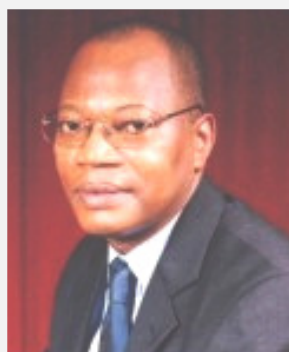
H.E. Dr. Mohammed Ibn CHAM-BAS, President of the ECOWAS Commission, was the signatory of the agreement between EUCLID and ECOWAS.

"We encourage our Participating States to avail themselves of all that EUCLID can offer"