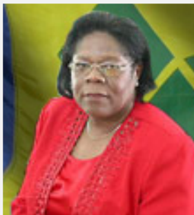
Above: Saint Vincent and the Grenadines Minister of Education Girlyn Miguel.

The tremendous workload placed on the shoulders of SVG government staff is acknowledged and EUCLID is trying to encourage course progress with a new system of "target dates" for program completion.