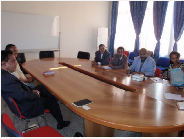
Photo: A senior EUCLID official assessing educational satisfaction during an official visit at a EUCLID Participating State Ministry of Foreign Affairs.