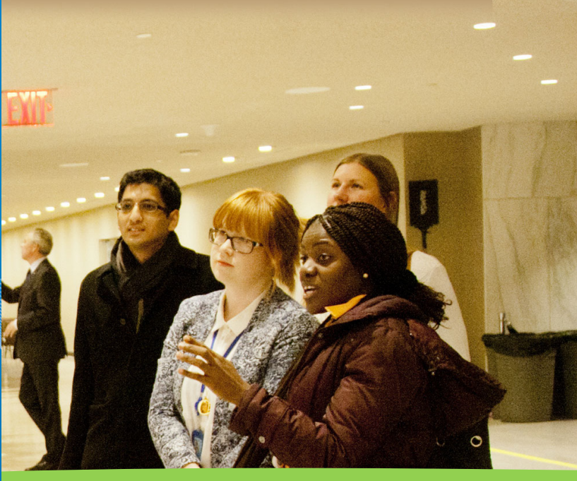
EUCLID: an intergovernmental treaty-based organization under public international law

Master (MSc) in Terrorism Studies and Deradicalization