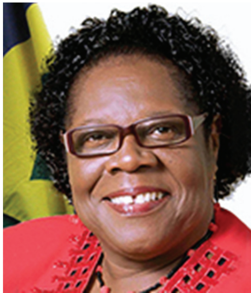
H.E. Minister of Education Girlyn Miguel (Also Deputy Prime Minister since 2010)